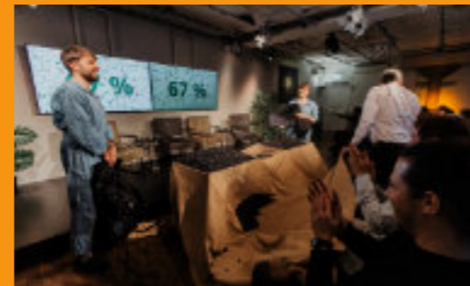
The seven largest pension funds divested 67% of their portfolio in June 2024.