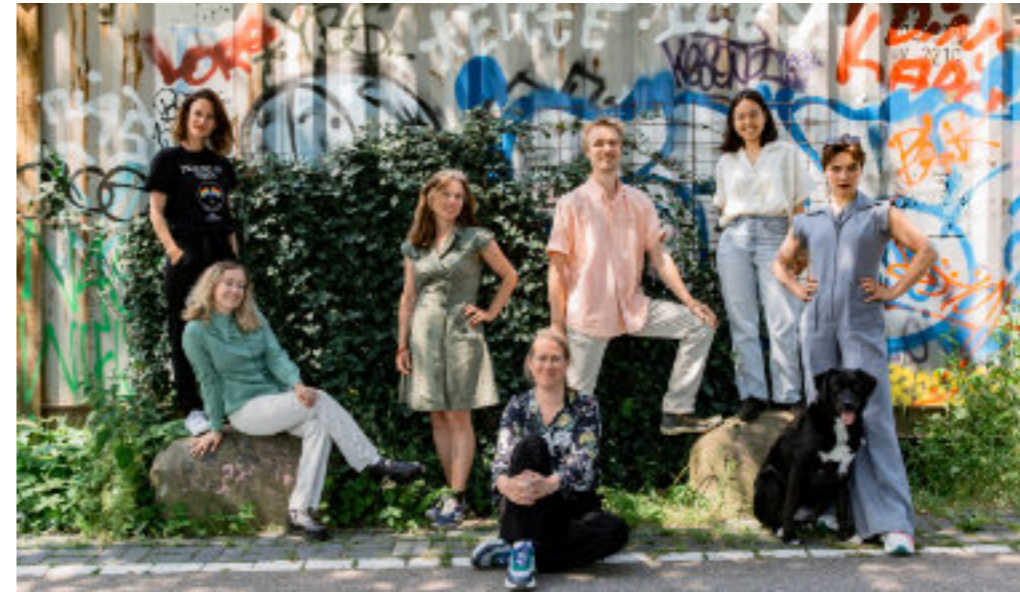
The Reclame Fossilvrij team.