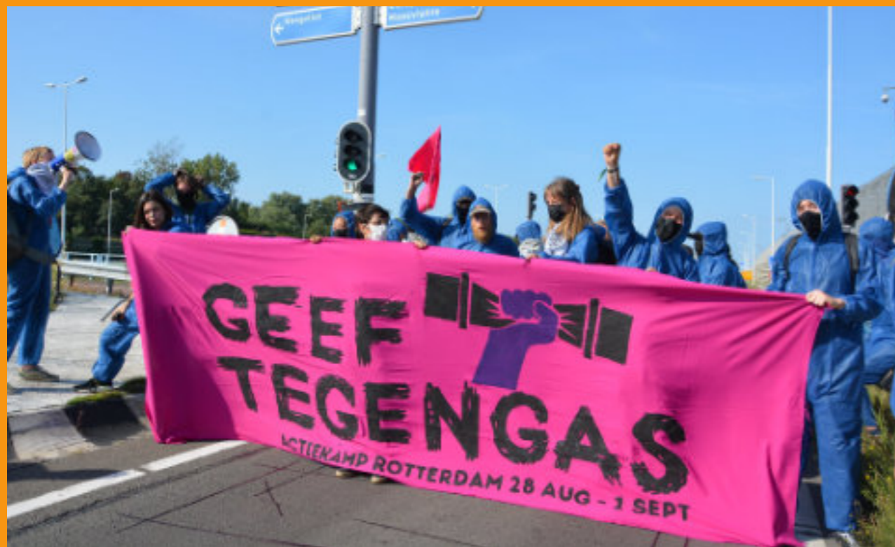
Action camp Geef Tegengas included panels, creative workshops and actions throughout the city of Rotterdam.

The Geef Tegengas action camp aimed to both raise awareness within the climate movement about liquefied gas and mobilise activists for ongoing action against the gas industry. In both respects, it marked a major step forward. 'Geef Tegengas' emerged from the camp as an independent and self-sustaining group. More people are joining the fight against expanding infrastructure that enables the global trade of polluting liquefied gas.