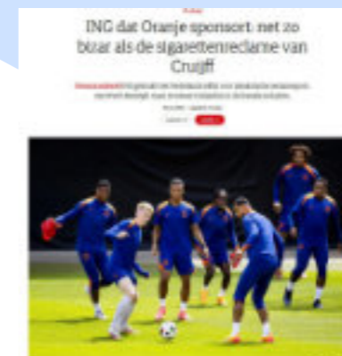
An op-ed by Fossil Free Football, calling on the national football team to stop accepting ING's money