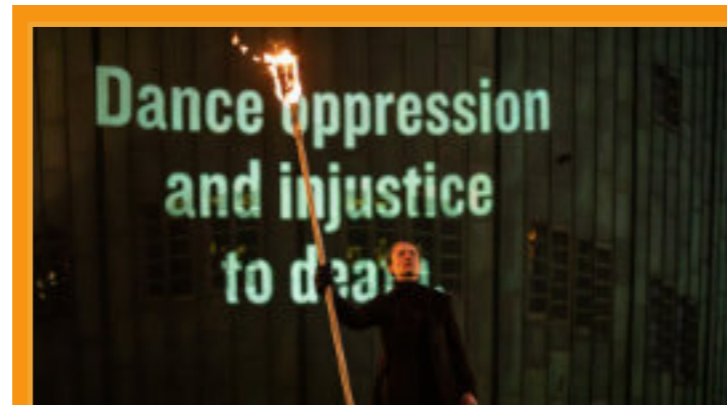
Fossil Free Culture NL Performance at NEMO Science Museum.