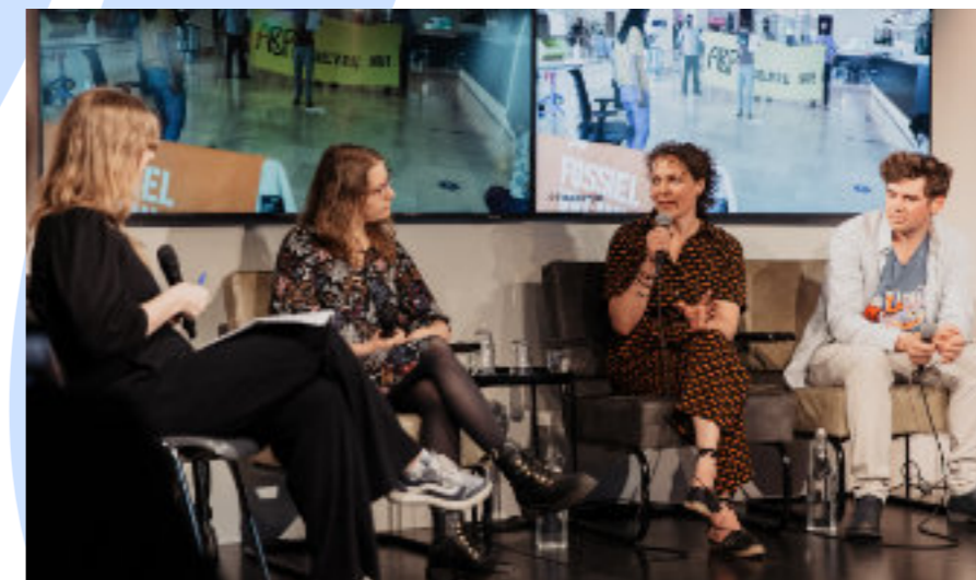
Pension participants exchange how they got their pension funds to divest at Pakhuis de Zwijger.

Together with GroenPensioen and Eerlijke Geldwijzer, we organised a public event in Pakhuis de Zwijger, to discuss the success of the divestment campaign. We asked Profundo to investigate if Dutch Pension Funds were indeed retracting their money from the fossil fuel industry. The research concluded that the seven biggest pension funds withdrew 67% of their money out of the fossil fuel industry. Important note: if we do not only look at upstream fossil fuel companies, but include companies that are involved in any aspect of fossil production, such as exploration, production, transport and consumption in power stations, the decline of fossil investments is less rapid.