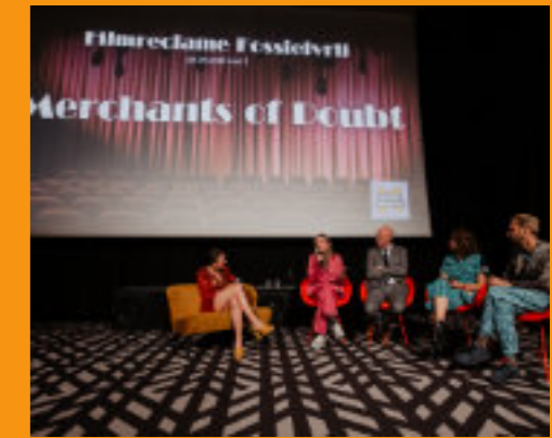
Reclame Fossilvrij calling on independent cinemas to stop fossil fuel advertising.