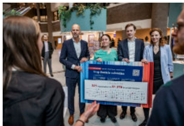
Over 50.000 people and over 300 organisations call on the Dutch parliament to stop fossil fuel subsidies.

Extinction Rebellion created huge momentum around the demand for an end to fossil fuel subsidies. To show that they are not alone in their demand, we initiated and led a coalition of NGOs, companies and institutions also calling for an end to fossil subsidies. We set up an urgent letter to the government which was signed by more than 325 organisations - including banks and pension funds - and 50.000 individuals, and handed this over to Members of Parliament in January 2024.