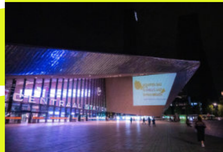
Guerilla projection against Shell at Rotterdam Central Station.