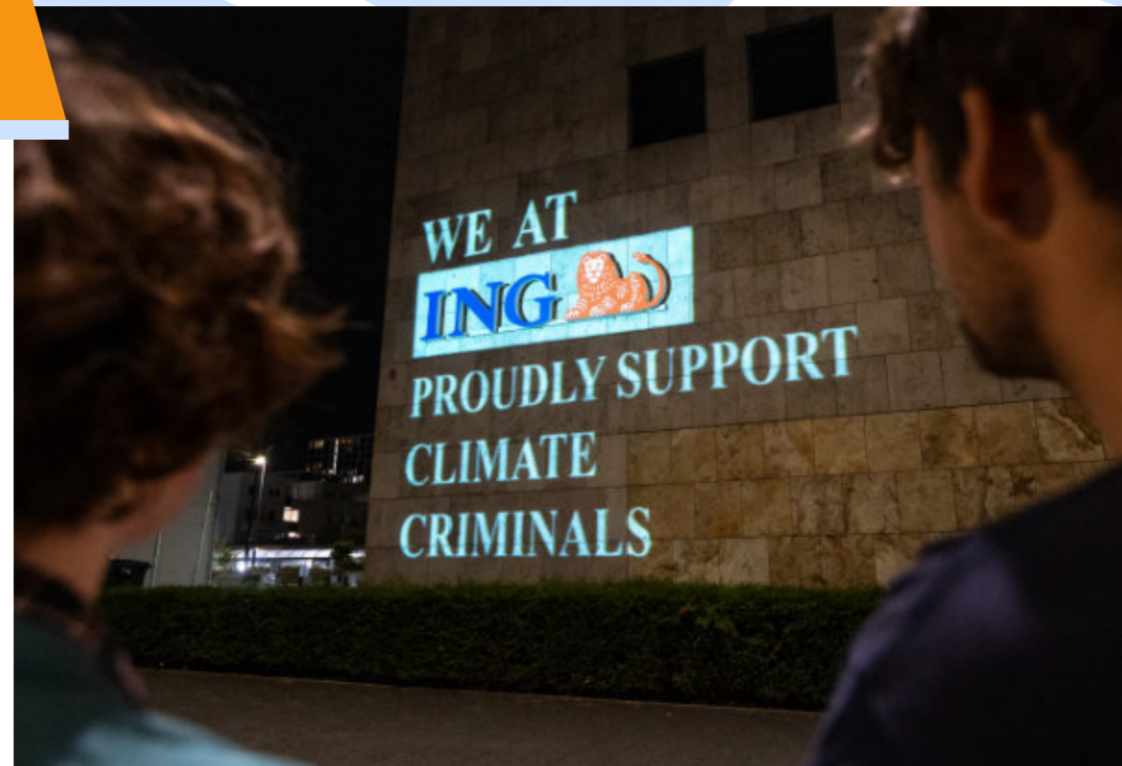
With a guerilla projection on ING's headquarters, we call on ING to end their toxic bond with Glencore.