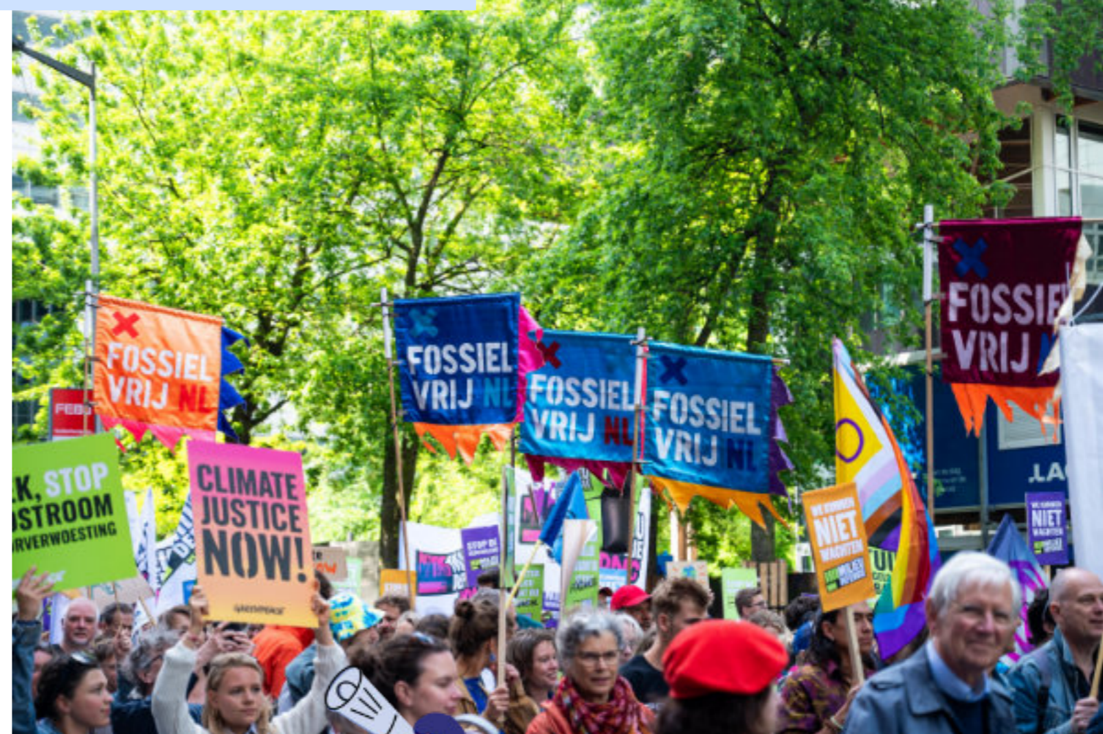
Fossilvrij at the Climate March at the Zuidas.