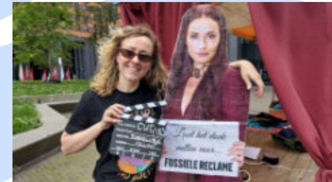
Reclame Fossilvrij's campaign is supported by Carice van Houten and other actors