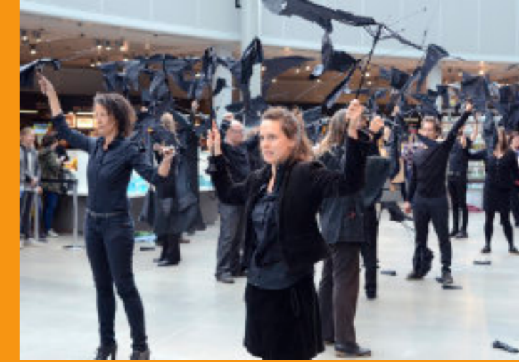
Fossil Free Culture performance in the Van Gogh Museum in 2017.

Send us an email at contact@fossilfreeculture.nl