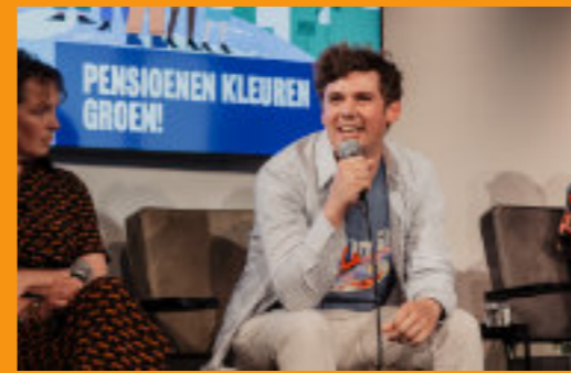
Reflecting on and celebrating huge divestment wins at Pakhuis de Zwijger.