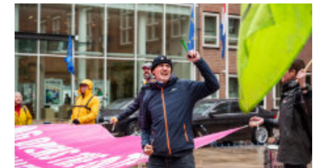
Noise demonstration against liquefied gas.

But we used other tactics too to spread our message. We initiated Rotterdam action camp Geef Tegengas - read more on page 24. We published multiple opinion pieces in national newspapers, launched GasLit (an online indie game) and organised activism workshops. And we did a projection action in Rotterdam.