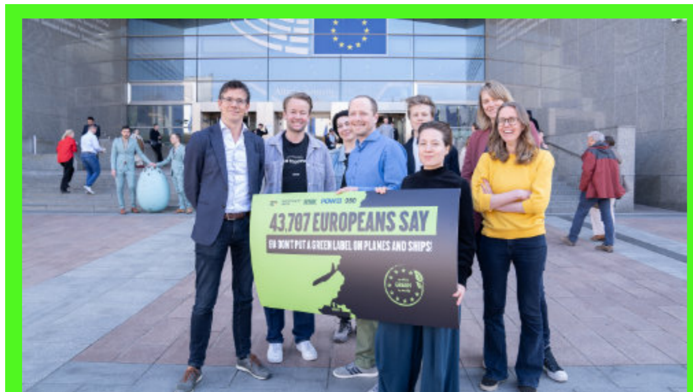
Over 43.500 Europeans signed a petition to support our lawsuit against the EU about the green label for (cruise)ships and airplanes.

However, the Commission rejected our request for review, and holds on to its stance that new fossil fueled planes and (cruise)ships can be considered green. That's why we decided to go to court. In August we filed our lawsuit at the Court of Justice.