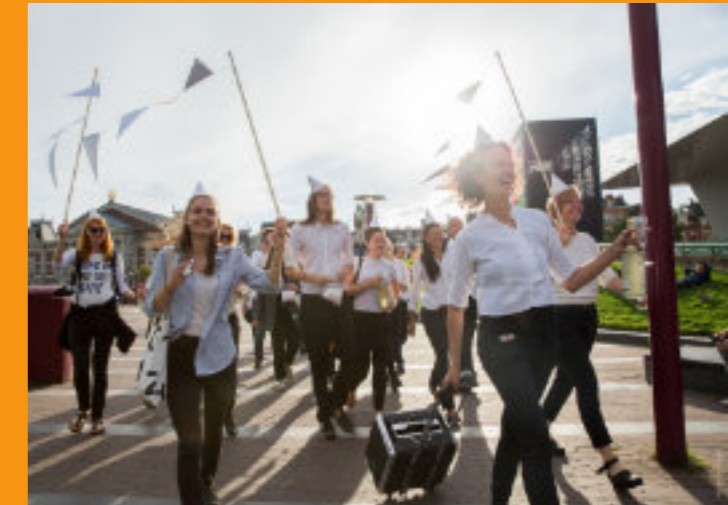
Celebrating that the Van Gogh Museum dropped Shell, in 2018.