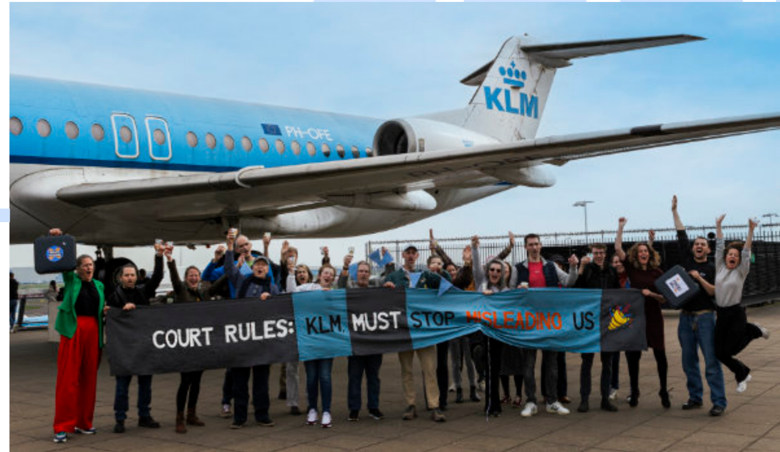
In March 2024, we celebrated winning our greenwashing lawsuit from KLM at Schiphol Airport.

While KLM is no longer allowed to greenwash, what about their marketing agency? In the midst of a climate emergency, it is really unethical to advertise polluting activities. That's why we paid two visits to advertising agency Dentsu, to spotlight their contribution to KLM's and MSC Cruises' greenwashing.