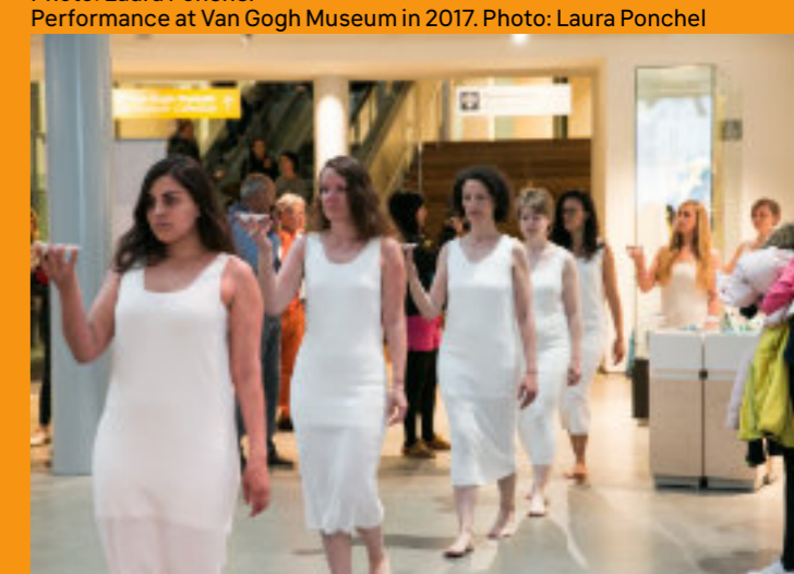
Performance at Van Gogh Museum in 2017.