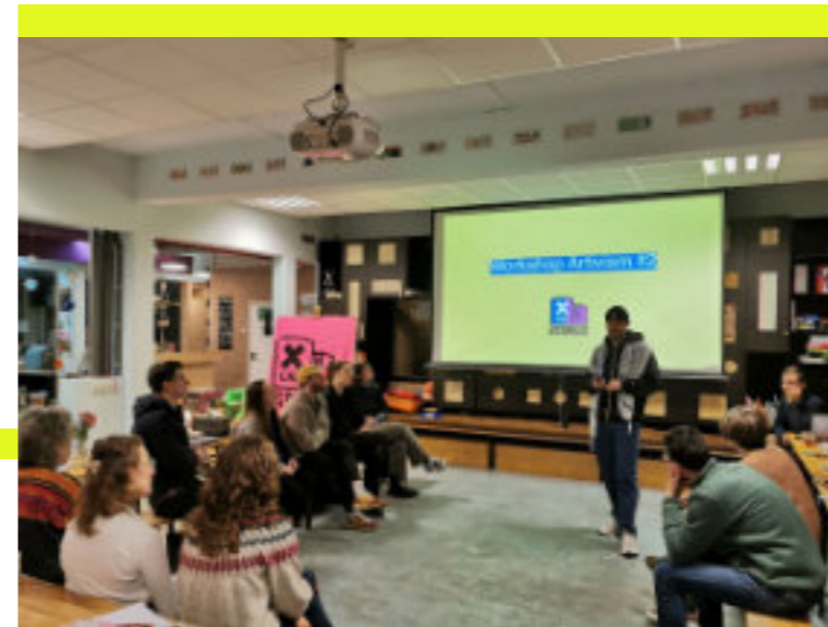
Activism workshop in Rotterdam.

This is devastating for the climate and people living near LNG infrastructure and gas fracking sites. The evidence is growing - in particular on American LNG - that there is a huge health- and social impact as well as frequent methane leakages. This needs to stop. That is why we are building a people powered movement against new liquefied gas infrastructure in the Netherlands and for a fast and fair gas phase-out.