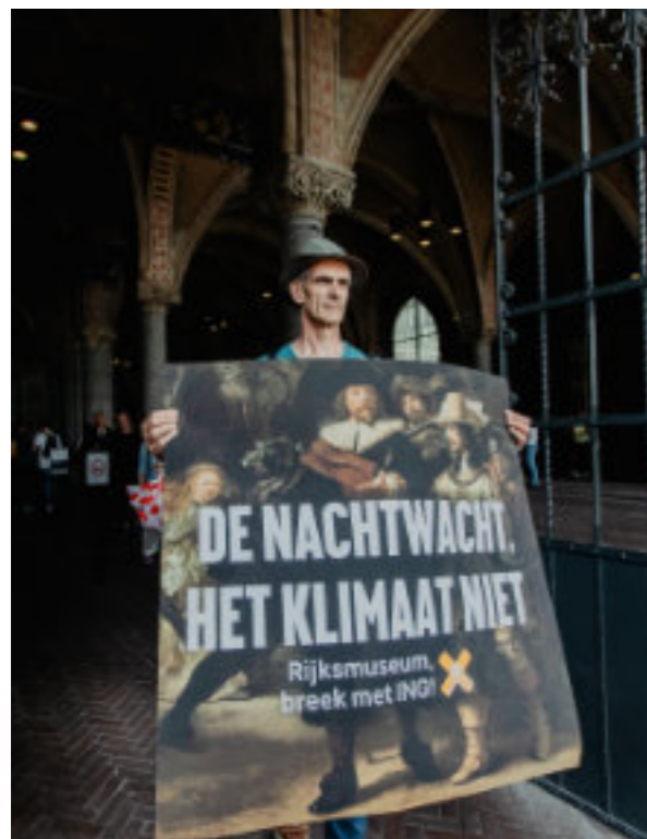
The 'Friends of the Rijksmuseum' deliver over 5500 signatures calling on the museum to end their sponsor relationship with ING.

Our movement's work is paying off: ING became the world's first bank to stop project finance for LNG export terminals and they stopped all financing – including corporate loans and underwriting – for pure play oil and gas companies.