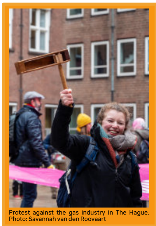
Protest against the gas industry in The Hague.