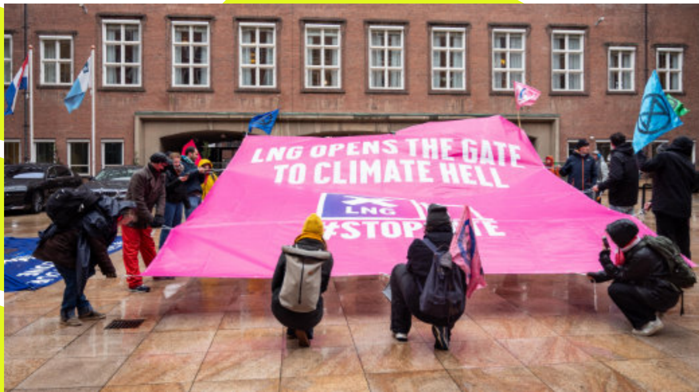
With a noise demonstration, we wake up minister Jetten at the ministry of Economic Affairs and Climate to the dangers of gas expansion – together with Extinction Rebellion.

With creative tactics, we make cracks into the clean image of dirty liquefied gas