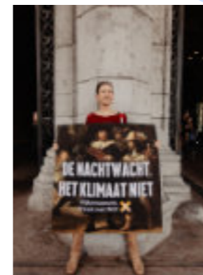
Activists demand that the Rijksmuseum cuts the ties with ING.