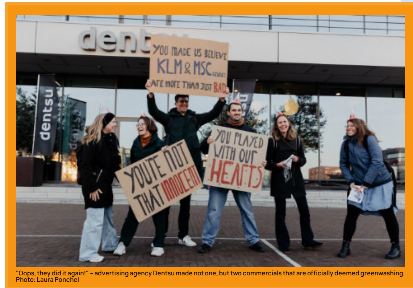
"Oops, they did it again!" – advertising agency Dentsu made not one, but two commercials that are officially deemed greenwashing.